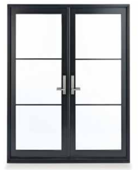
Contemporary option with 3-11/16" stiles and rails shown

E-Series hinged patio doors make a dramatic statement and add great ventilation. Their contemporary or traditional styling options fit well with any home's style. Made of wood protected by an aluminum exterior, it's our fully customizable hinged patio door.